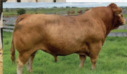
Grand Sire NSC 20B Diamond C Braveheart