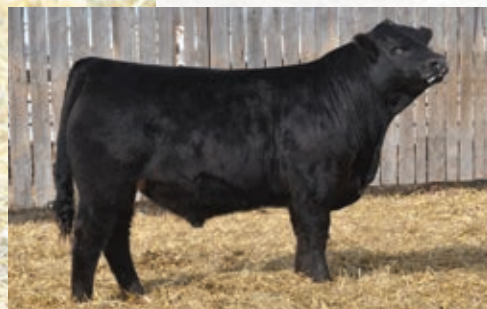
Sire Boss Lake Border Agent 967G ET