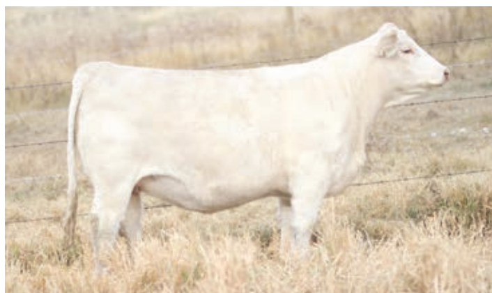
Dam Miss Prairie Cove 28J ET