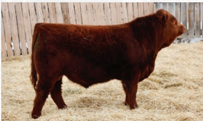
Maternal Brother NSC 6J Diamond C Jazz Man - Sold To Lazy S Limousin