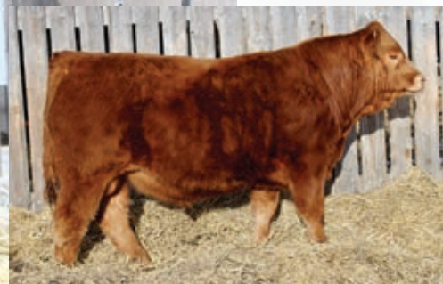
Sire of Lots 40, 41 &amp; 42 NSC 22F Diamond C Friendly Giant