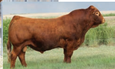
Sire RPY Paynes Cracker 17E