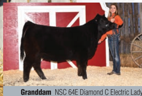
Granddam NSC 64E Diamond C Electric Lady