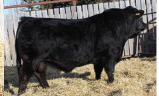
Sire of lots 21 &amp; 22 NSC 68D Diamond C Django