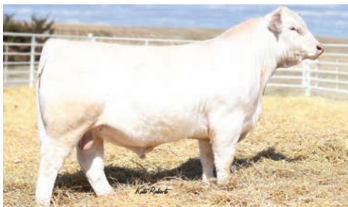
Sire GHC Reagan 9012