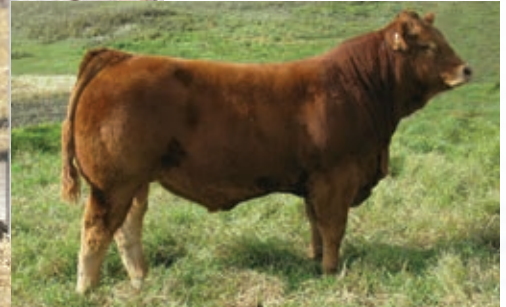
Sire of lot 23 & 24 RPY Paynes Tank 12G